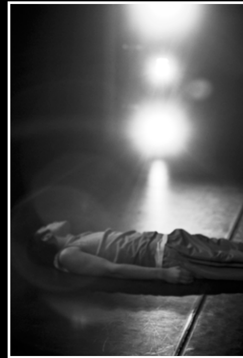
Astral / Out Of Body / Transcendence