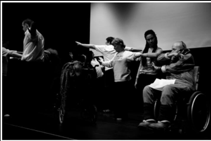
Dance Aware. Elements to Rehearsal