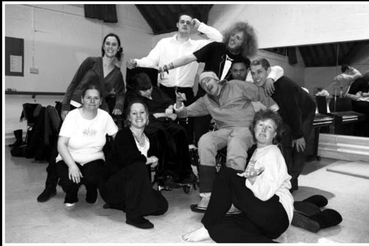
Show Business. Dance Aware