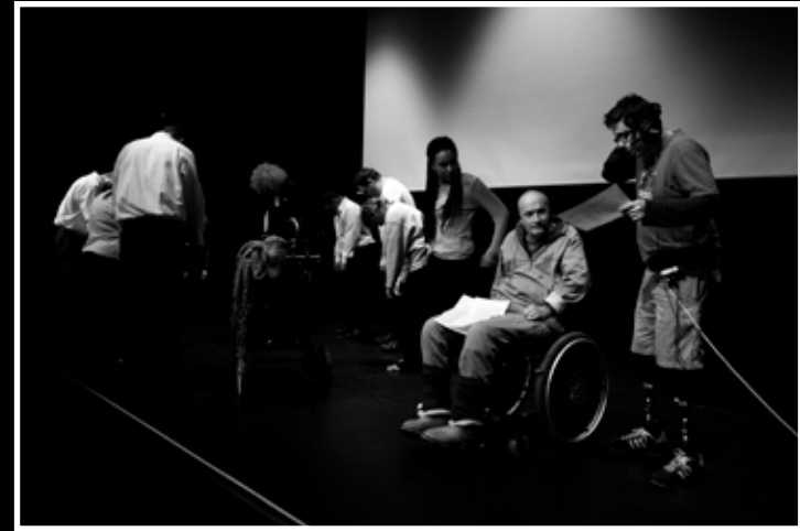
Dance Aware. Elements to Rehearsal