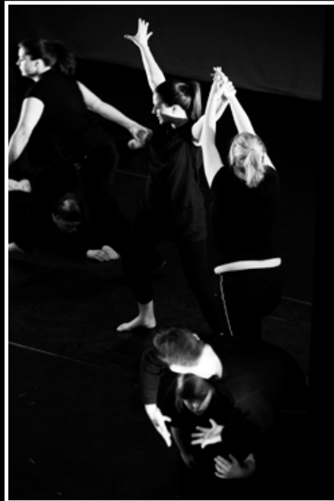
New Rhythms, Interlinked