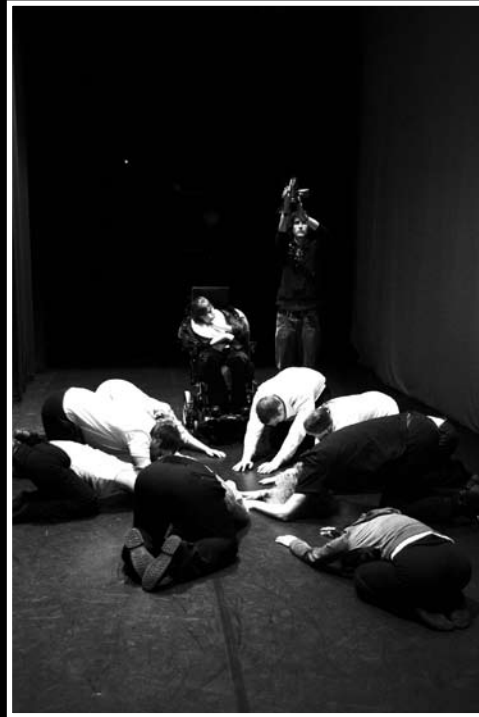
Ritual. Dance Aware