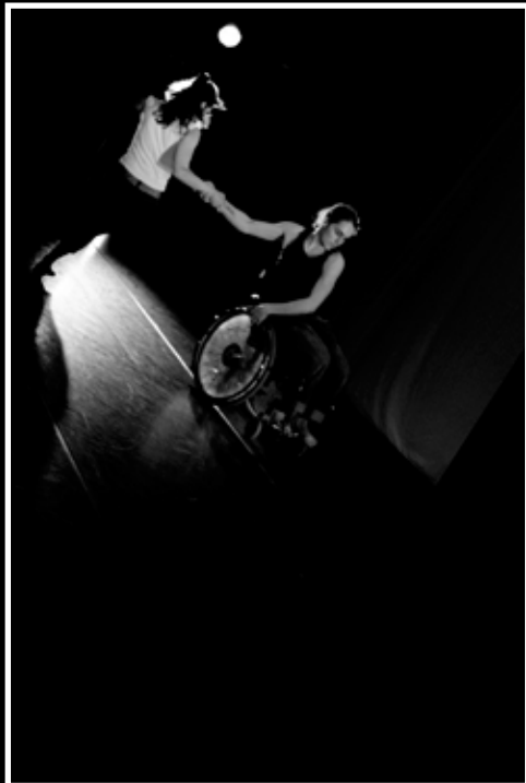
Duet In The Dark