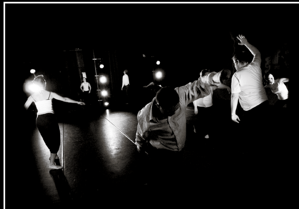
Body N Soul

Published by Holton Lee 2008 Registered as East Holton Charity No. 1011867