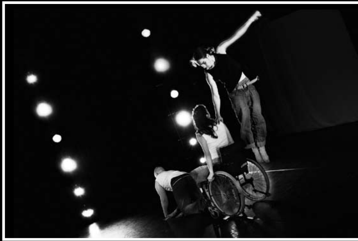
Leap of Faith