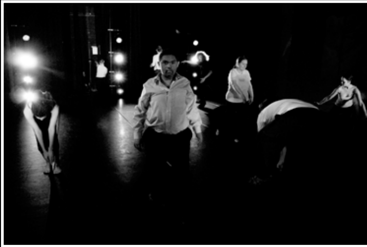
Bodies in Space