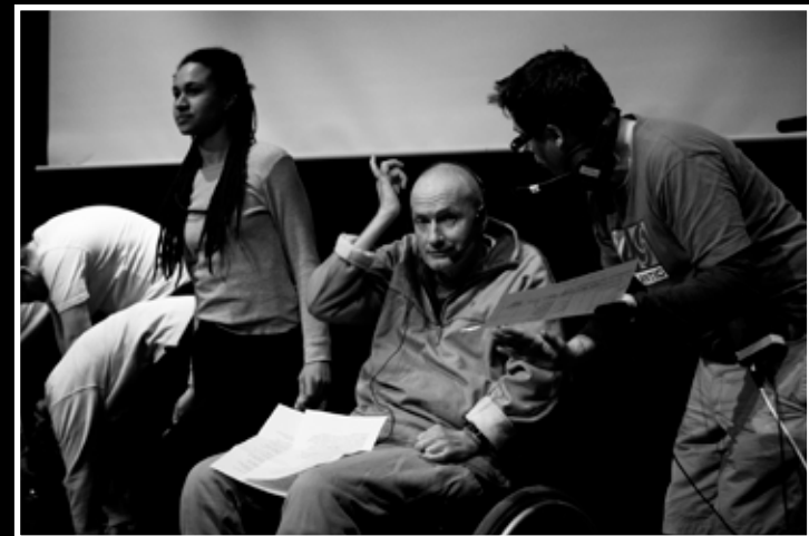
Lights, Camera, Action