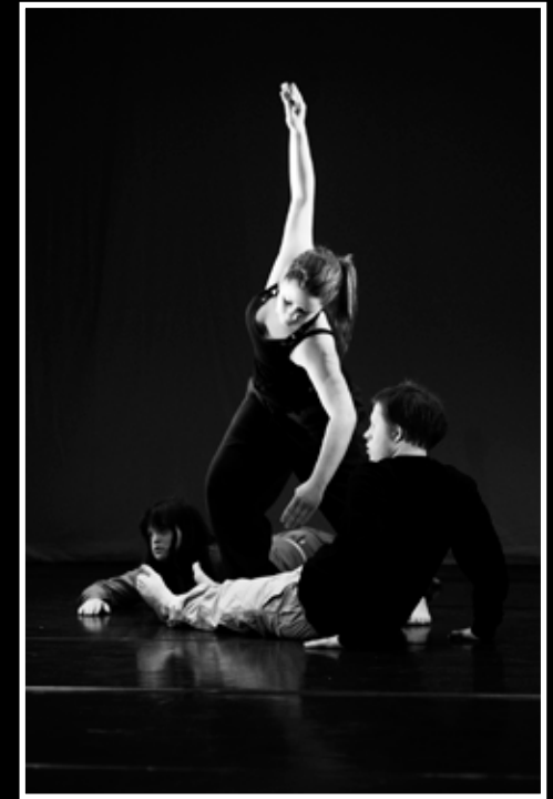
New Rhythms Extended