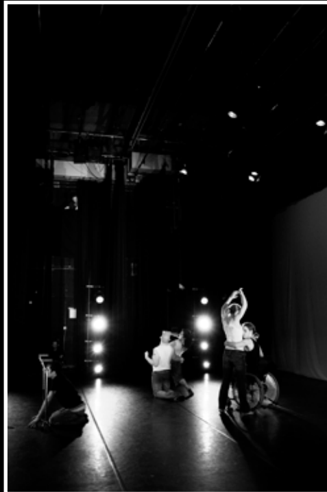
Full Front Stage