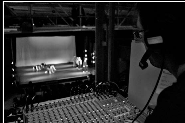
Movement & Machine