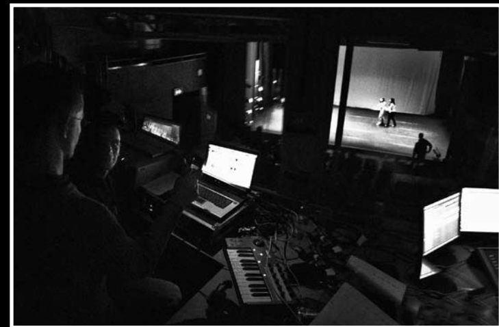
Back Stage Gossip