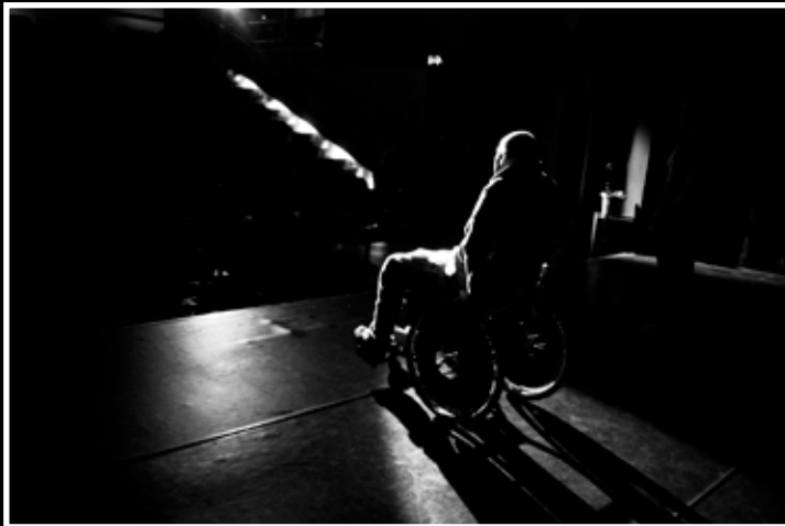
Edge Of Unknown